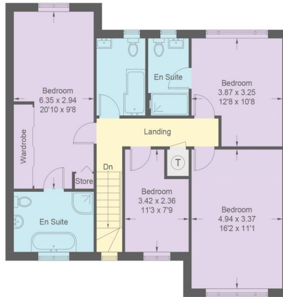
First Floor - 82.4 sq m / 887 sq ft

Approximate Gross Internal Area = 184.9 sq m / 1990 sq ft (Including Garage)